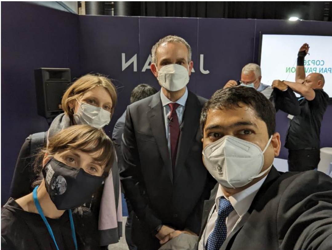
Our CEM team on the ground at COP26. Thanks to everyone for the many bilateral meetings and catch-ups. It was great seeing many of you in person!